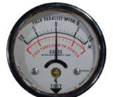
Residual Field Indicator