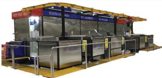
FPI Booth System Electrostatic Spray Type