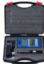
Probe Gauss Meter