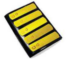
Magnetic Flux Indicator