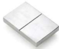
Aluminium Test Block