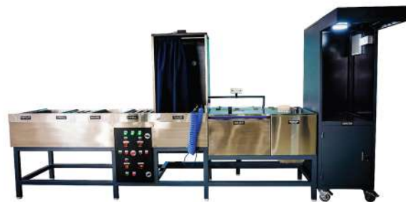
FPI Dip Tank System