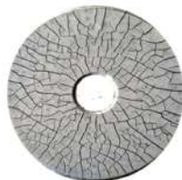
MTU Test Block