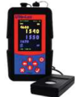
UV/ White Light Intensity Meter