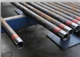
Oil & Gas