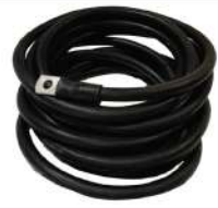
Mag Cables 120 Sq.MM