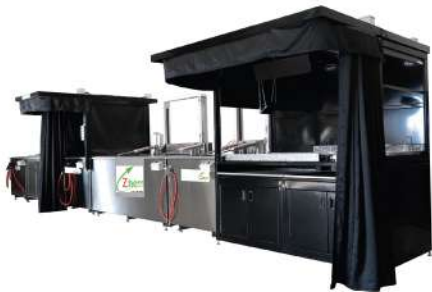
Pre cleaning & Post cleaning system