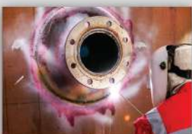
NDT Inspection Companies