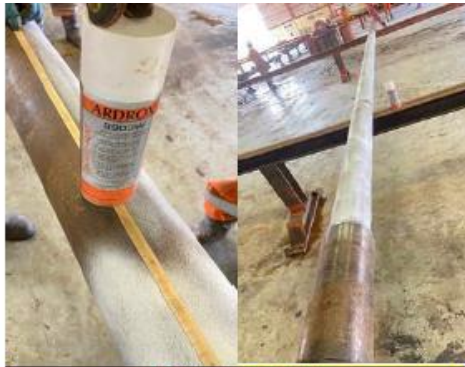
5.68M + 0.02 M = 5.7 M